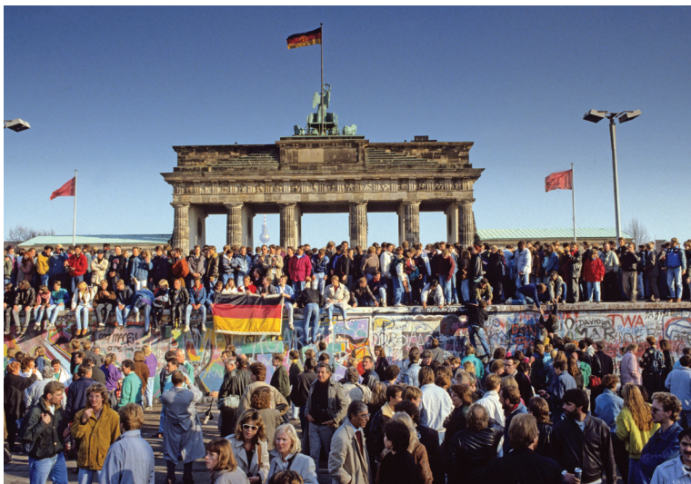
SOURCE 1.10 On the evening of 9 November 1989 and into the next day, thousands of Berliners climbed on top of the wall and tore parts of it down with sledgehammers and chisels.

by the East German police marked the beginning of the month. On 9 October 1989, 70 000 people took part in a candlelit parade to call for change. This time, against all expectations, the East German police did not react.