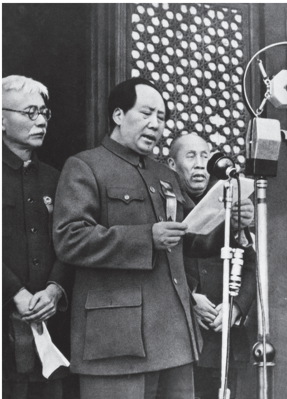
SOURCE 1.3 On 1 October 1949, a second front was opened in the Cold War when Mao Zedong (centre) declared the People's Republic of China under Communist Party rule.