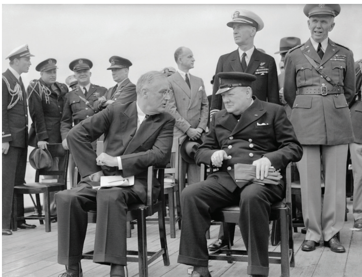
SOURCE 1.9 US President Roosevelt (left) and British Prime Minister Churchill (right) jointly signed the Atlantic Charter, an outline of Anglo-American political and economic values.