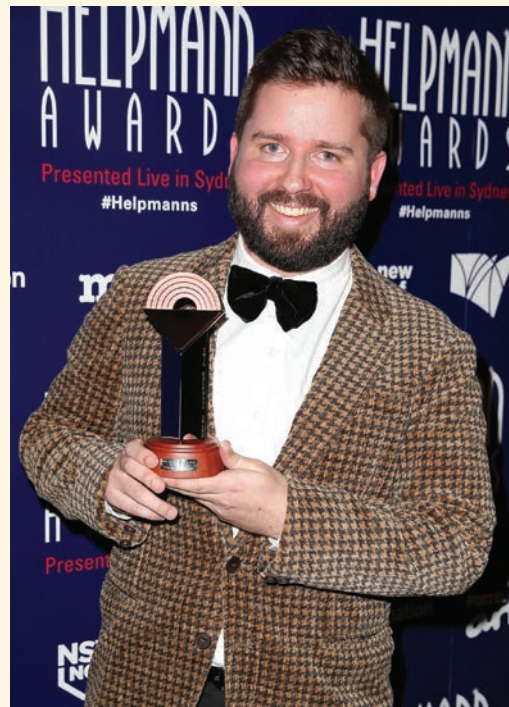
Getty Images/Brendon Thorne

Kip has worked on a number of screen projects, including the short films B, Bee & Mee and Walk ; and music videos Little Fingers and Botanist for the band Guineafowl, the latter of which was listed in ABC's rage top 50 music videos for 2009.