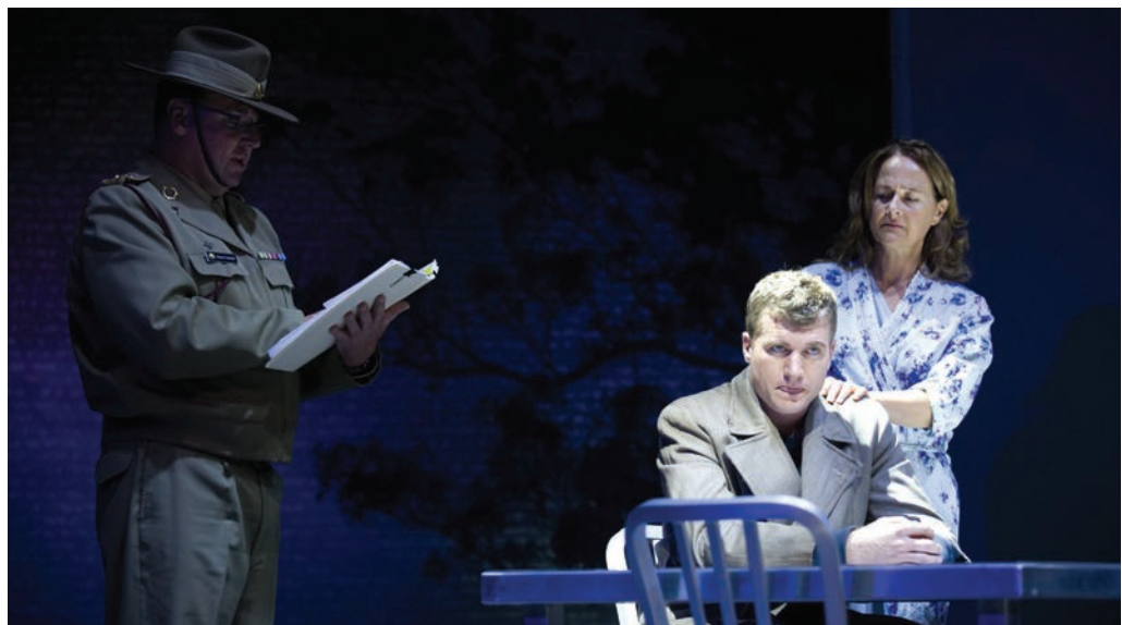
The Long Way Home by Sydney Theatre Company